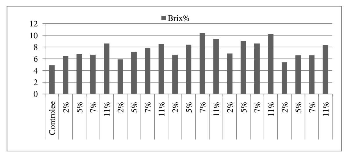
Figure 1. Total sugars content in plant tissue from pot experiment with lettuce grown on alluvial meadow soil

From the lettuce plant analysis, it appears that as the mixture rate increases, the total nitrogen, phosphorus and potassium content in the vegetable mass also increases. The P content in plants is from 0.16 to 0.45%. The K content ranges from 3.0 to 7.3%. There is no clearly expressed pattern for content of heavy metals in plant tissues compared to the control. Lead and cadmium have the same values for all variants <0.1. Heavy metals in lettuce in all variants are below the allowable concentration. The content of sugar in aqueous solution (Brix%) is an important indicator as it can determine the growth of plants. When we measure the sugar levels in plants it directly corresponds to how much sugar production has taken place in the plant. The measured sugar levels in lettuce from the vegetation experiment directly correspond to the plant development.